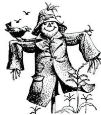
The Scarecrows are coming!