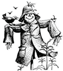
The Scarecrows are coming!

When we started looking for a Sister City, “Nibley, England” was a natural place to start. We are currently establishing a twinning relationship with North Nibley and have sent over a Sister City request package which included a formal Sister City request letter, Nibley City History Book, artwork from our 2nd graders depicting what Nibley means to them, and samples of local products, just to get things started. We also recently