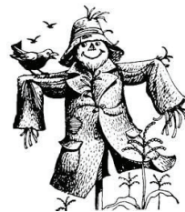
The Scarecrows are coming!