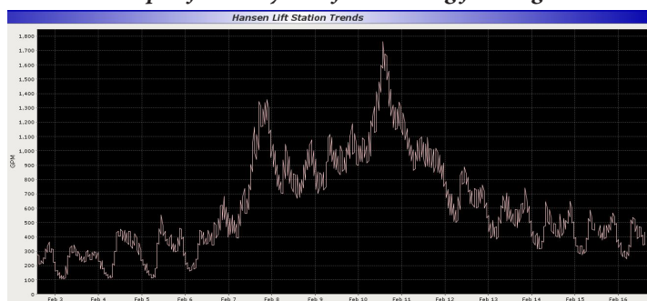
Graph of sewer system flows during flooding.

The Nibley City Council will meet March 30 and April 20 at 6:30 p.m. at Nibley City Hall. The Nibley City Planning & Zoning Commission meets the second and fourth Wednesday of each month at 5:30 p.m. All meetings are open to the public. Meeting minutes and audio recording can be found at www.nibleycity.com .