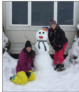
The Knight's (above)