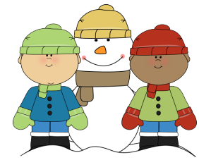
The Rigby kids (below)