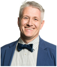
Mayor Shaun Dustin