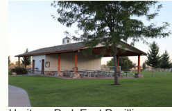
Heritage Park East Pavilion

Nibley's park pavilions have re-opened and can be reserved online.