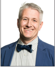
Mayor Shaun Dustin