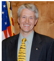
by Mayor Dustin